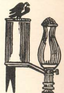
PATENT DIAMOND PASSAGE OR WALL LAMP.